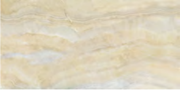
60x120 cm Vitrified - Polished rect. ⚡ 1,3 cm