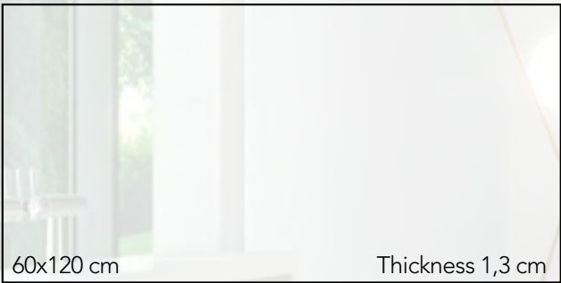
60x120 cm Thickness 1,3 cm

The thin vibrant veins of Onyx brighten any space and decorate the surfaces with the energy of stone. The natural elegance of this mineral is suitable for any type of coating. Its characteristic colours clad environments and bring out its best qualities.