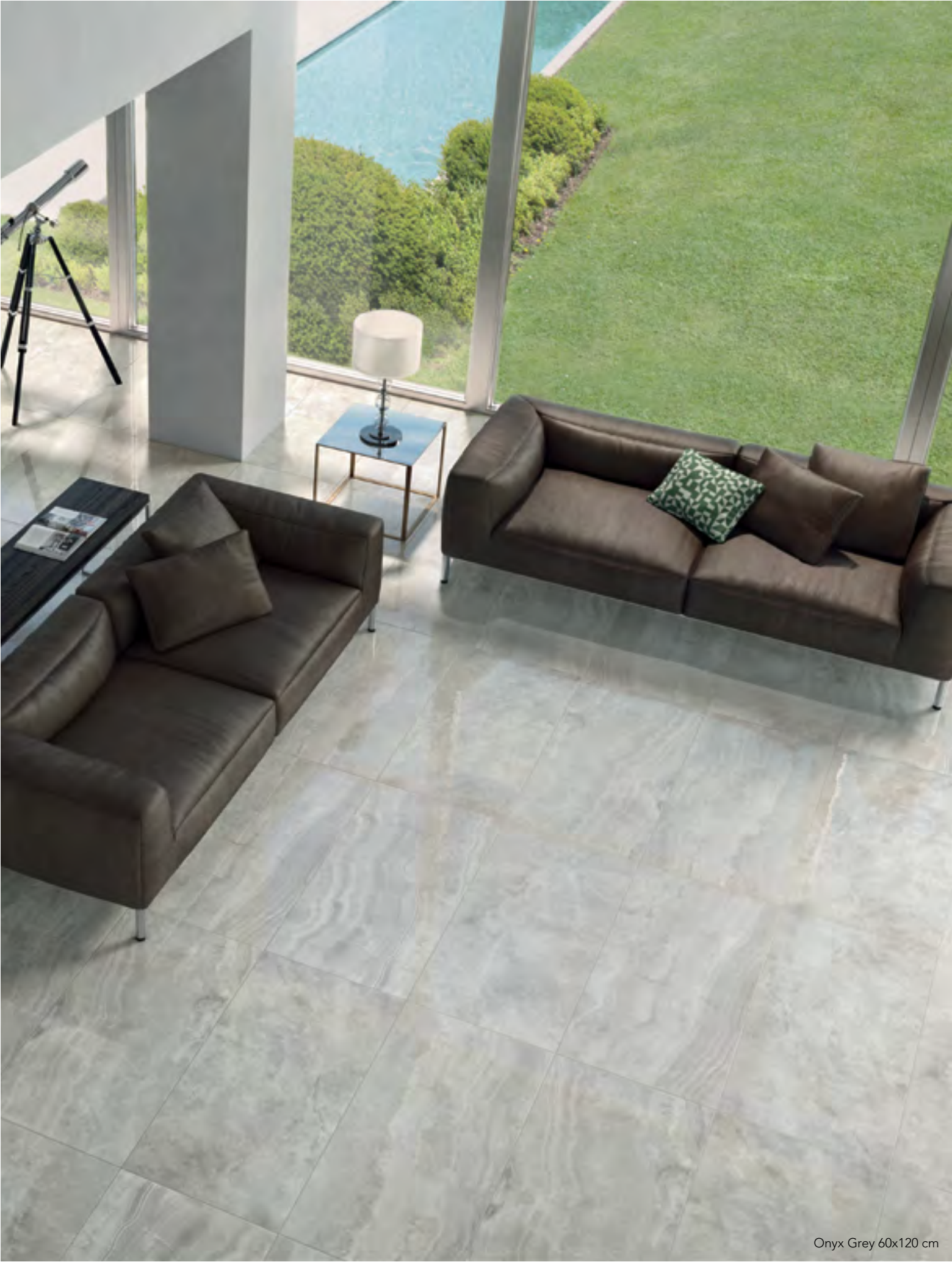
Onyx Grey 60x120 cm

Minimum suggested joint for indoor fixing 2 mm