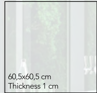
60,5x60,5 cm Thickness 1 cm