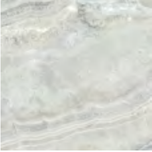
60,5x60,5 cm Vitrified - Polished rect. ⚡ 1 cm