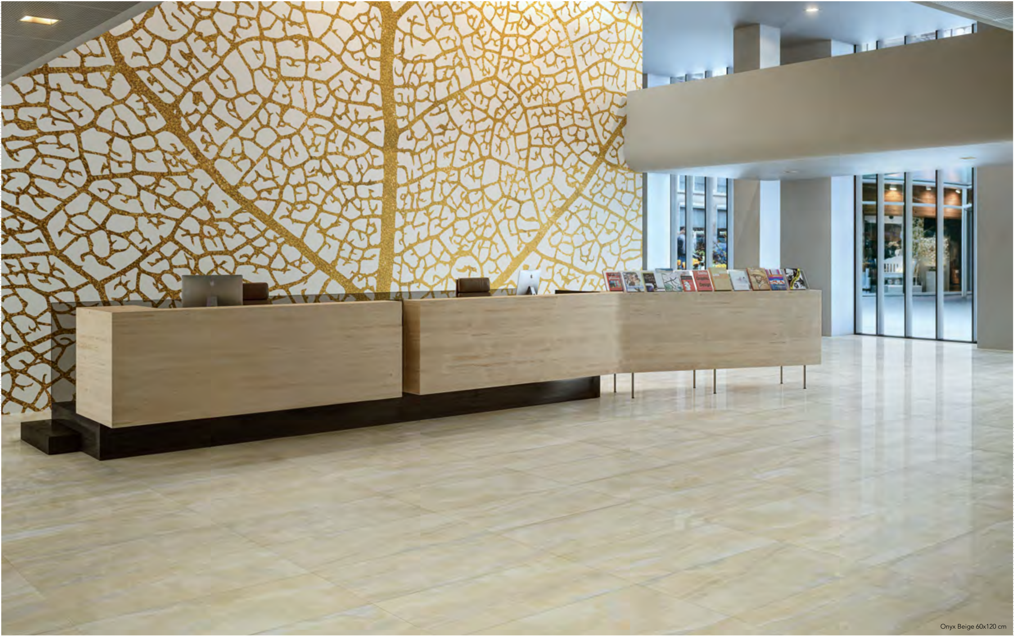
Onyx Beige 60x120 cm