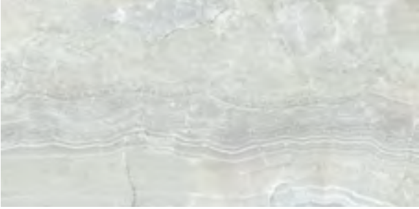
60x120 cm Vitrified - Polished rect. ⚡ 1,3 cm

Minimum suggested joint for indoor fixing 2 mm